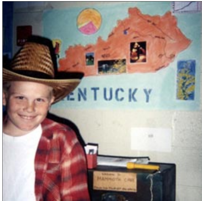
Students participating in the Cynthia Mann Elementary School States Fair dressed as state representatives and used their technology skills to share information with parents and guests.

presentations on their state. The presentations were compiled onto a CD-ROM for parents and guests to purchase, turning the event into a fundraiser as well. Students even